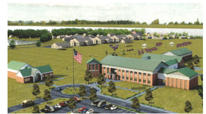
Artists rendering of the Regional Training Institute at Camp Rell.

The Enlisted Association of the National Guard of the United States