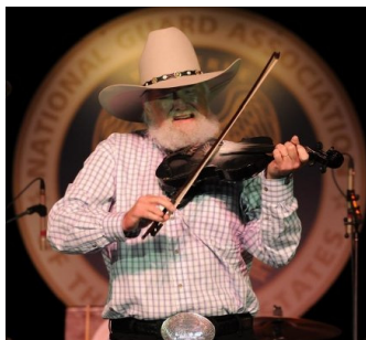
Legendary Country Performer Charlie Daniels at the NGAUS Annual Conference in Nashville, TN

This year's conference proved to be an educational and developmental experience for each of the attendees. We heard from the leadership of the services and the National Guard on the strategic direction of the military and how the NGAUS can assist. We were exposed the latest