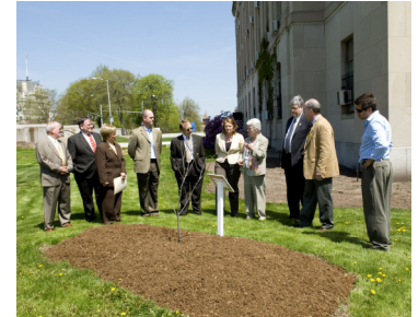
Dedication of the American Elm sapling from the Survivor Tree of the April 19.1995 Oklahoma City bombing of the Murrah Federal Building in front of the State Office Building. The tree was dedicated to the citizens of Connecticut from NGACT.