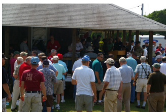
2009 Retiree Picnic at "The Point" at Camp Rell